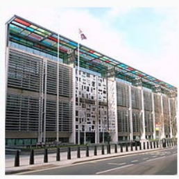
Home Office Headquarters Rationalisation